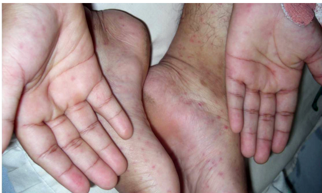
Figure 5. Discrete erythematous maculopapular rash involving palms and soles in SFG rickettsial infections.

For the IFA assays we used antigens of R. conorii , a member of the SFG rickettsiae, prevalent in southern Europe, in many parts of Africa, and in Asia. However, this organism has a wide antigenic