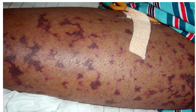
Figure 3. Severe vasculitis with fern leaf type skin necrosis in a spotted fever patient.

Of the 105 patients who were serologically positive for Rickettsia IgG antibodies, 53/105 (50.5%) were male and 52/105 (49.5%) were female, and their mean age was 40 years (range 11–83 years). Most of the clinical features were common to all of the patients ( Table 3 ). In the SFG infection patients, 13/55 (24%) had life-threatening severe vasculitis with fern leaf type skin necrosis ( Figure 3 ) and 17/55 (31%) had arthritis ( Figure 4 ). Three patients (5%) had altered levels of consciousness. These patients required administration of intravenous corticosteroids in addition to intravenous chloramphenicol for clinical recovery. Scrub typhus infections were mild, but one patient had transient deafness. None of the 105 patients had eschars, but 14/55 (25%) SFG patients had a history of tick bite prior to the onset of fever. Thirty-nine SFG