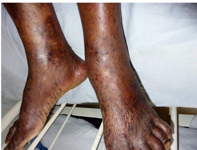
Figure 4. Acute arthritis involving ankle joints in spotted fever.

patients (71%) had a maculopapular rash distributed mainly on the limbs, including palms and soles (Figure 5, Table 3). Of the clinical cases for whom IFA assays were not done, three died of their illness due to a delay in diagnosis and in starting appropriate treatment. All three had extensive vasculitis with fern leaf skin necrosis and later developed irreversible multi-organ failure. The patient with murine typhus had a milder form of infection, but had transient confusion. Of the serologically confirmed group (Table 3), 43/63 (68%) had fever and a skin rash, 62/63 (98%) had fever with a response to antibiotic treatment, and 44/63 (70%) had a skin rash with a response to antibiotic treatment.