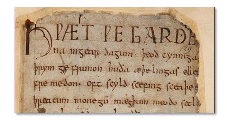
Figure 2: Part of the Cotton MS Vitellius A XV manuscript currently located within the British Library.

commonly used words in Modern English have Old English roots. The words be , strong and water , for example, derive from Old English. Some words that are derived from Old English are: axode(asked), habba \tilde{A}^{\circ} (have), rihtlice (rightly), engla (angels), heofonum (heaven), swilcum (such), hu (how) and beon (be). Old English was spoken from 450 AD until around 1100 AD. Figure 2 depicts a part of the first folio of the heroic epic poem Beowulf, written primarily in the West Saxon dialect of Old English.