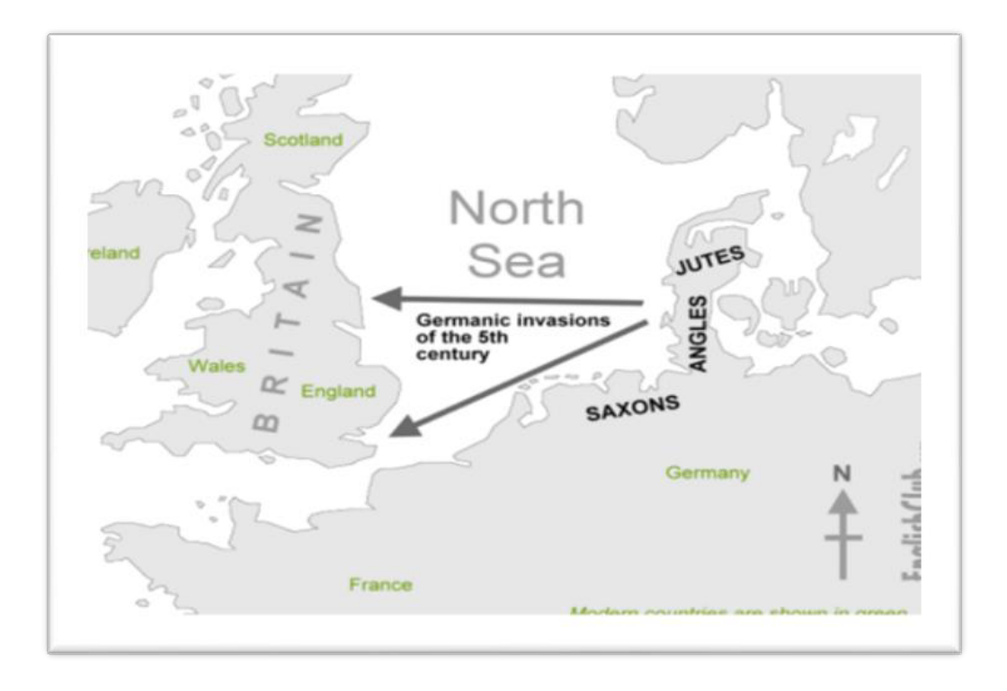
Figure 1: Entering of Germanic invaders to Britain on the east and south coasts in the 5th century

English language has undergone substantial changes through time from its inception and a brief analysis of the timeline of history of English reveals that it is traditionally divided into four periods.