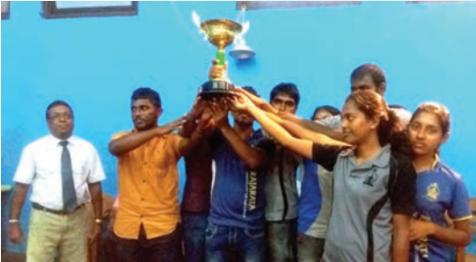
Inter Faculty Sports Tournament-2015 12 th to 23 rd September 2015