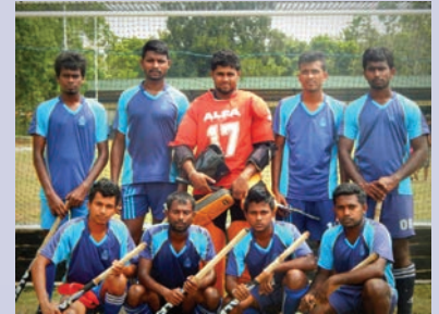
Fresher's Sports Tournament (2013/2014 Batch) 28 th November to 08 th December 2015