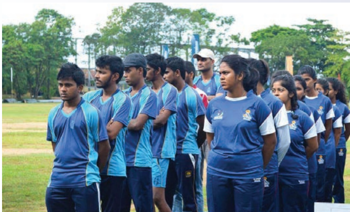
Flag Football Tournament – 2015 Organized by Elite Football League