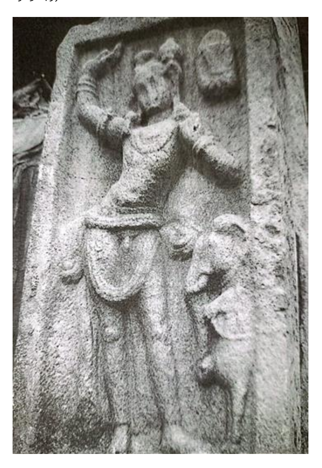
Fig. 4. The male figure depicted on the stale at Northern Ayake of the Jethavana Stupa ( 3^{\rm rd} to 4^{\rm th} Century AD)

Among his special duties in South India is the night vigilance of villages. There Ayyanar rides on a horse. According to his genesis story, he has become a Hindu deity through the rebirth that takes place at a later time. When the facts of the genesis story are considered logically, his father is Lord Shiva. Then Shiva calls the son Ayyanar , an avatar or spirit of Vishnu who successfully works against the demons (Parker, 1903:149).