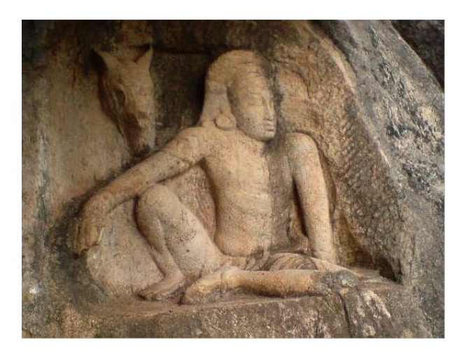
Fig.1. Ayyanayake, Isurumuniya, Man and horse head (5<sup>th</sup> Century AD)

The belief of this deity is widespread in the North-Central and North-West province Also, a carving of Lord Ayyanayake, depicted in a very high relief, can be seen at the left end of the stone door frame of the Deundara temple (Fig. 2). Here, the male figure of God is depicted as riding on a horse, which is mounted on two rear legs, just like Nillakgama. With his right foot trampled a dwarf. Here, Vamana has been beautifully carved as if he is struggling to press the Lord's feet. The time here is belongs to the 13th century AD. That time was the time when Deva Prathiraja, the minister of King Parakramabahu II(1236-1270 AD) of Dambadeniya, carried out the development of the temple at Deundara. Ayyanayake, who is born from Shiva and Vishnu (mohini), and he belongs to the Vamana community, who is later blessed with Kuvera status, have the same birth relationship, though distant. But the dwarf community has been working under Ayyanayake as a group of servants (Ibid.218-220).