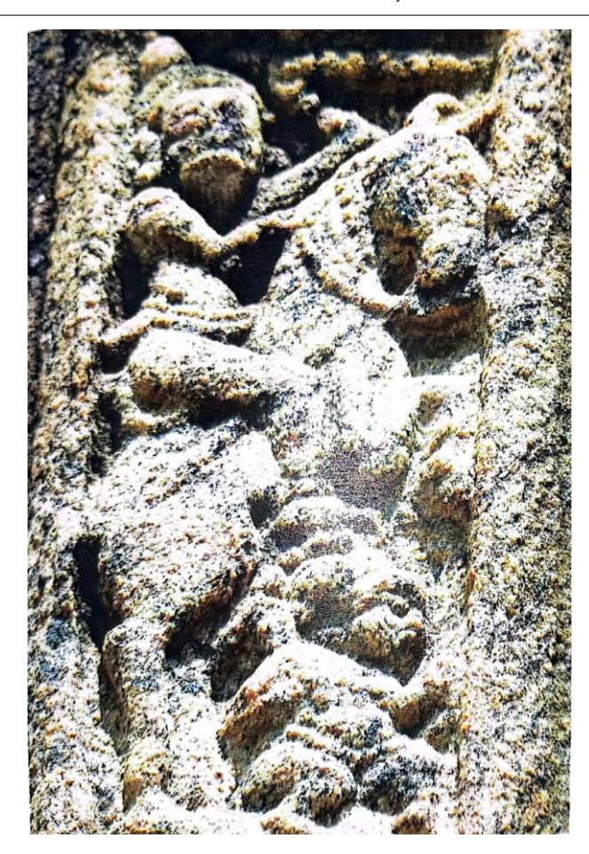
Fig. 2. Ayyanayake – Depicted in the stone Door Frame at Deundara Devalaya (13<sup>th</sup> century).

Mohini represents one of the guises of Vishnu (Parker, 190 3: 147). A connection between Vishnu and Shiva can also be discerned according to the Bhagavad Purana. Here it is stated that after Vishnu came to Shiva in the guise of Mohini, she got a child from Shiva (ibid: 147). This baby appears before the world as 'Aiyanar' born from the right hand of Lord Vishnu. He is 'Aiyanar' in Sinhala. Parker says that the interpretation of the Tanjore temple is more correct. Interpretation of the so-called Tanjore temple indicates that this deity is known as Keiyanar in South India (ibid: 148). He also appears as "Nayanar" - son of Hara or son of Vishnu and Hara or son of Shiva (ibid: 148).