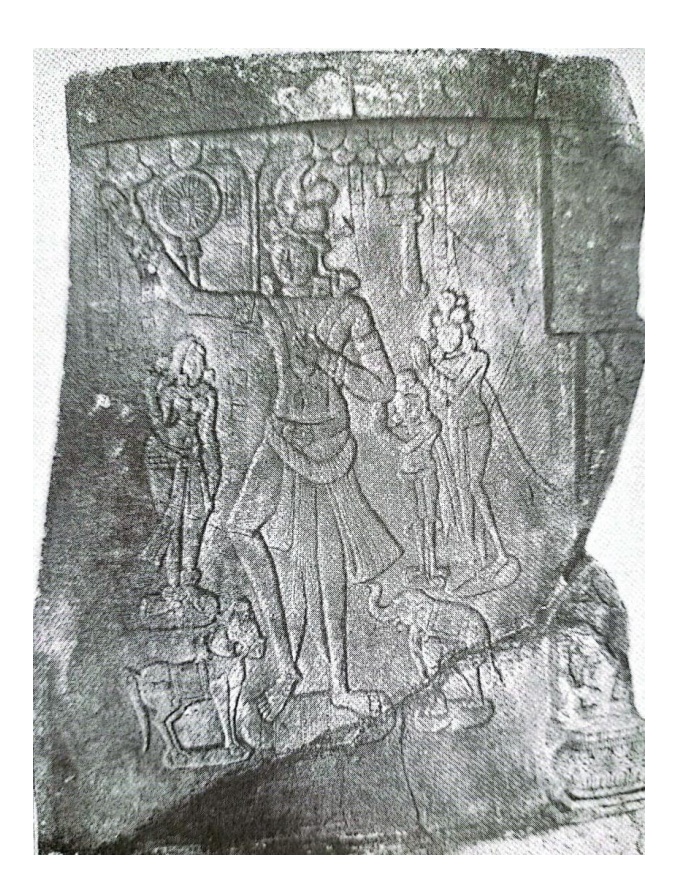
Fig. 5. carving belonging to the Jaggayyapeta Stupa at Amaravati

In the Yathikas of Kandy Province, he appears not as Ayyanar but as Bilinda. It is called Baby Devil. This belief also prevails among the villagers and the milk mother has an Ayyanar connection. Deity Ilandari is the youth of Ayyanar. Both of them are the same God called by different names (Ibid:150). Ayyappa's origin as a child is reflected in several myths. According to one story, the child was found by King Pandalam on the banks of the river Pampa. The Pandalam dynasty was a Pandya dynasty, and the childless king took Bilinda to his palace and raised her with love. This little boy showed his power by killing the demon Mahisha (Dalal, 2006:43).