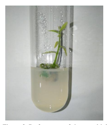
Figure 3. Performance of shoot multiplication (in vitro developed Aquilaria crassna shoots in T3).

Means with the same letter (a,b) in a column are not significant at p<0.05.