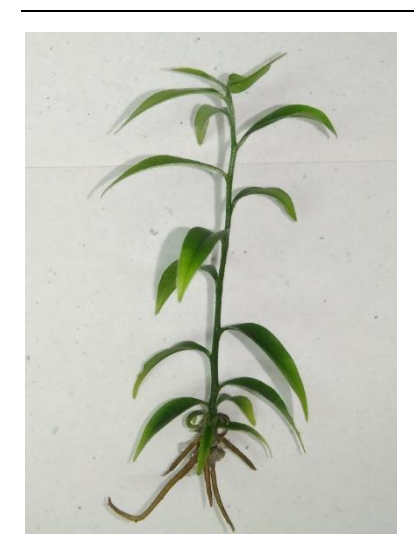
Figure 4. Performance of root induction in vitro developed Aquilaria crassnashoots in Treatment T2.

ISSN: 2582-4112, Available at www.ijvsar.com