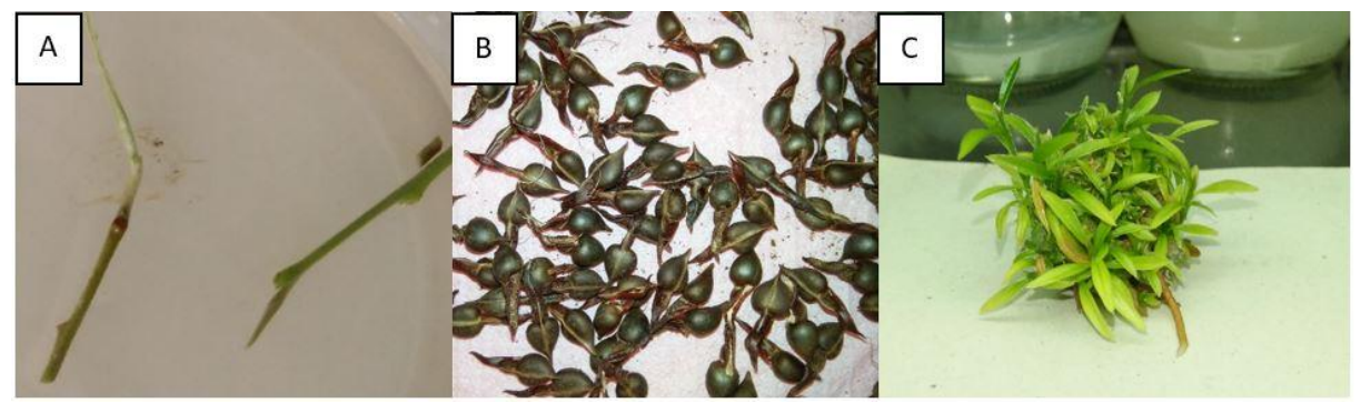
Figure 1. Agarwood (Aquilaria crassna) explants. (A) shoot tips, (B) seeds (C) in vitro developed shoots.

Shoot tips and seeds (Fig.1) were collected from healthy Aquilaria crassna plants from the research field of the Central Research Station, in Matale, Sri Lanka to identify the best sterilization procedure. In vitro grown Aquilaria crassna shoots (Fig.1) available at the tissue culture laboratory in Central Research Station were also used. All the laboratory experiments were also conducted in the Central Research Station. Woody Plant Medium (WPM) was used as the basal medium with different hormonal combinations for all the experiments and sterilization treatments.