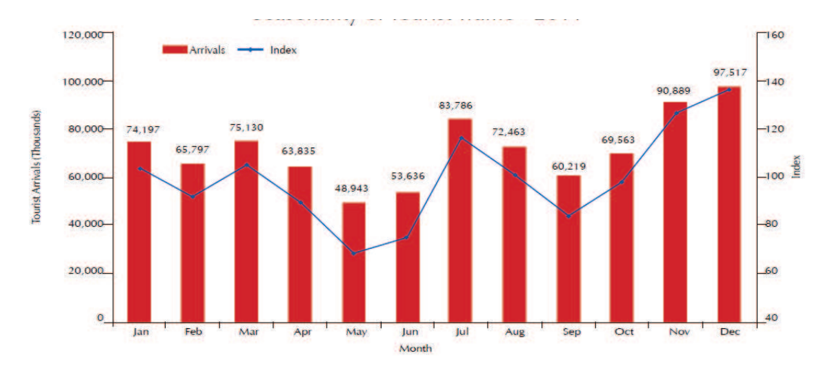
Figure1: Seasonality of Tourist Traffic

These spiritual values of the Cultural Triangle has been promoted by tourism administrative organizations when they promote Sri Lanka for tourist with different backgroud. Being align to these practices Sri Lanka to promotional campaign"12 refreshing themes in 12 months" is developed with the association of tourism industry where they have marketed April for People & Culture, May & June Religious expecting more tourists. (Tourism Development Strategy 2011-2016), and the www.lonelyplanet.com 2012, Sri Lanka has been identified as the best seasons from April to September for the ancient cities region and the east coast for leisure purposes.